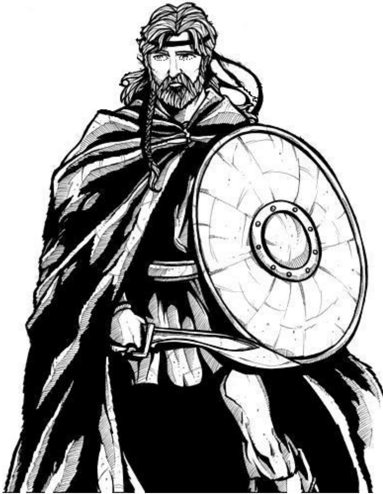
Viriathus - Portuguese national hero.